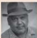
MR NOEL PEARSON

Mer Artistic Director, choreographer, visual artist, writer, actor and daughter of Eddie Koiki Mabo