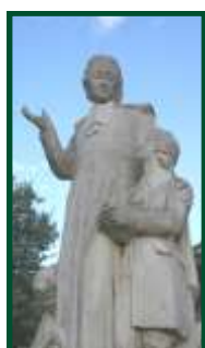
St John Baptist de La Salle, Pray for us Live Jesus in our Hearts, Forever